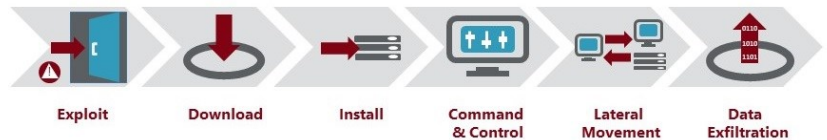
Figure 1: The Cyber Kill Chain

Despite the advanced level of cyber security technology in place and all the efforts made by administrators to protect their networks, no organization is immune from malware attacks. Malware will try to penetrate a network through email phishing, a compromised external drive, an infected personal device, an IT misconfiguration or an unknown exploit. Once it has gained entry to the network, the attack typically evolves through the different stages of the cyber kill chain. It carries out early reconnaissance, creates a state of persistence, seeks access to the outside world through a Command & Control server, and then initiates a series of lateral movements (access to resources, propagation, privileges, etc.), until it reaches its final goal of data exfiltration, data destruction, or demand for ransom.